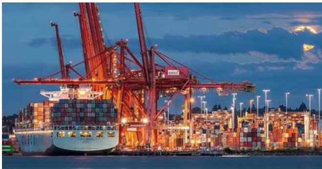
Port of Vancouver