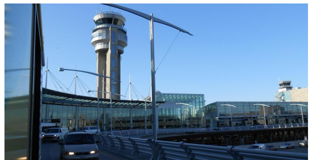
Montréal – Trudeau International Airport