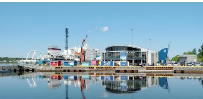
Port of Sydney